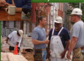
Focused on housing and public safety issues while on the council.

Martin is married to Katie Curran O'Malley, and they live in Northeast Baltimore with their four children: Grace (13), Tara (12), William (7) and Jack (2).