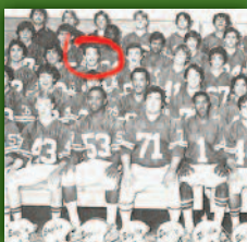
On the football team in high school